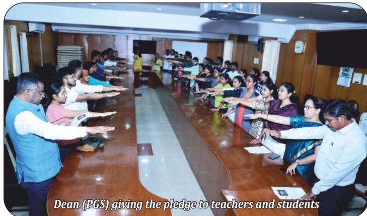
Dean (PGS) giving the pledge to teachers and students