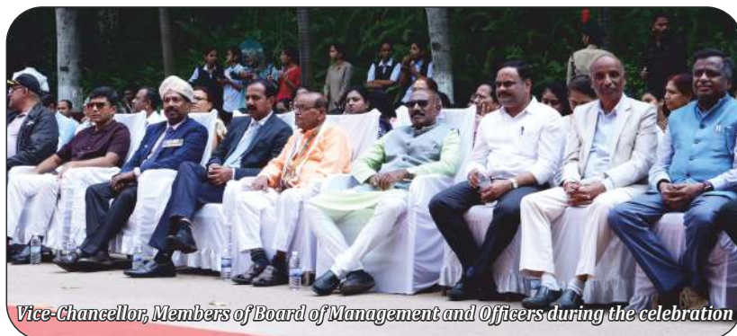
Vice-Chancellor, Members of Board of Management and Officers during the celebration