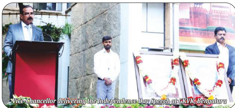
Vice-Chancellor delivering the Independence Day Speech at GKVK, Bengaluru