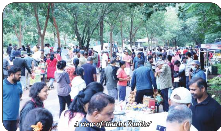
A view of 'Raitha Santhe'