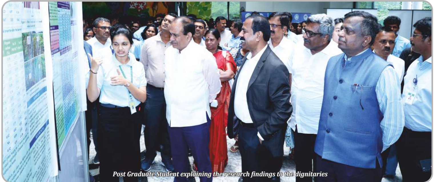
Post Graduate Student explaining the research findings to the dignitaries