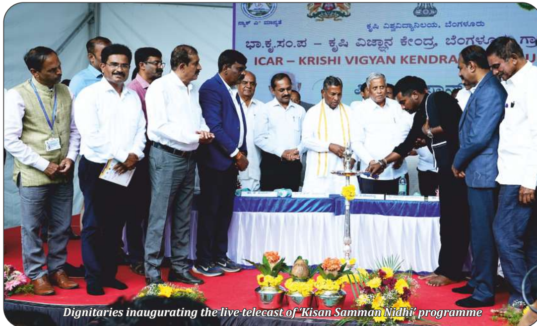
Dignitaries inaugurating the live telecast of 'Kisan Samman Nidhi' programme

ICAR-KVK, BENGALURU RURAL DISTRICT, hosted a live telecast of the release event of 20 th instalment of PM Kisan Samman Nidhi, which was announced by Shri Narendra Modi, Hon'ble Prime Minister, Government of India on 2 nd August, 2025. The event commenced with the dignitaries performing the ceremonial lighting of the lamp. Shri V. Somanna, Hon'ble Union Minister of State,