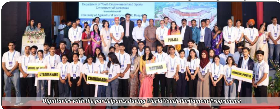
Dignitaries with the participants during World Youth Parliament Programme