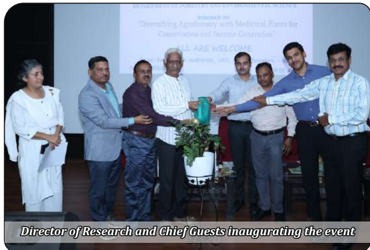
Director of Research and Chief Guests inaugurating the event

DEPARTMENT OF FORESTRY AND ENVIRONMENTAL SCIENCES, CoA, GKVK, collaborated with Karnataka State Medicinal Plants Authority to host a one-day workshop on 'Diversifying Agroforestry with Medicinal Plants for