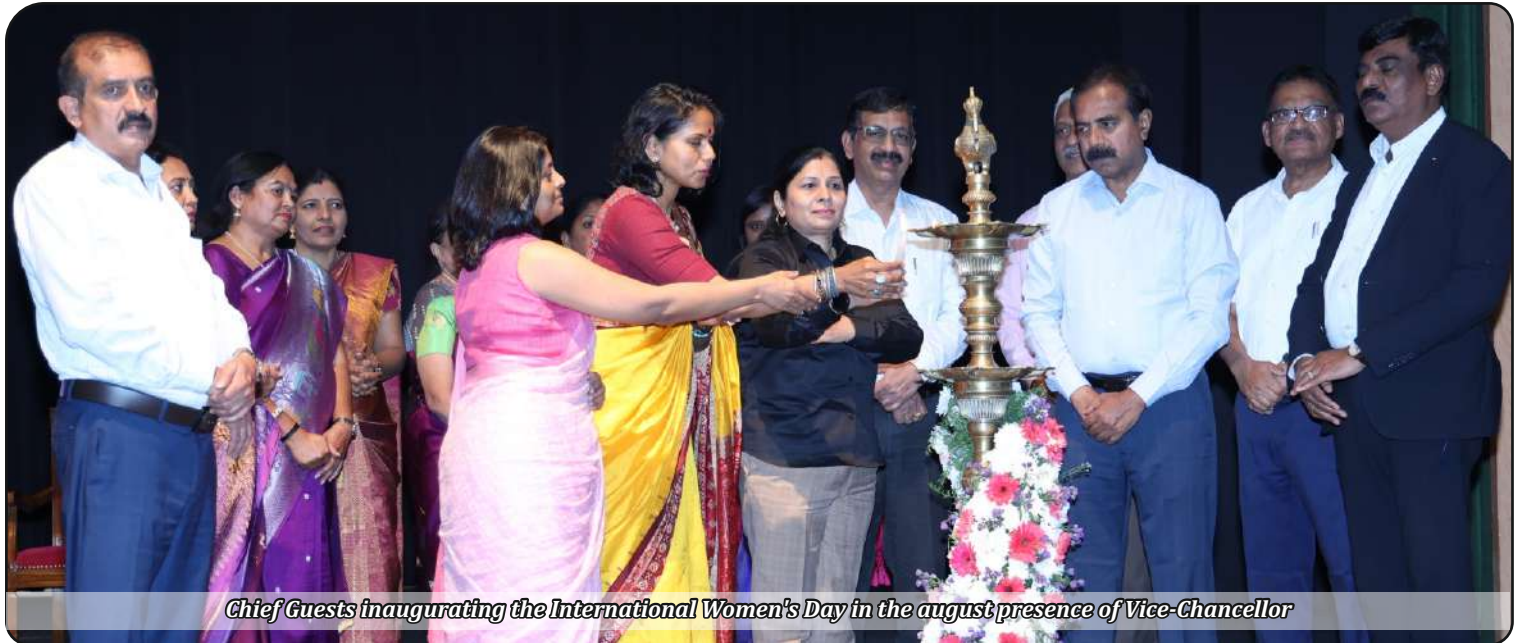
Chief Guests inaugurating the International Women's Day in the august presence of Vice-Chancellor