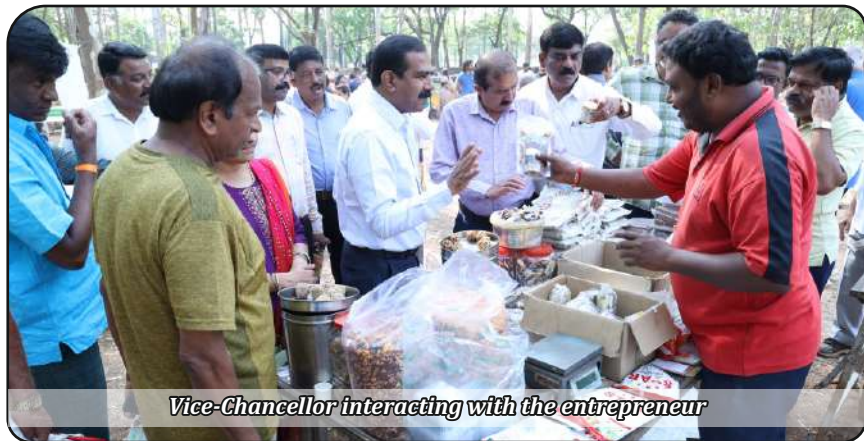
Vice-Chancellor interacting with the entrepreneur