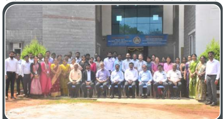
Vice-Chancellor with the participants of 6 days induction programme held from 2 nd to 7 th March, 2026 organized by Staff Training Unit at GKVK