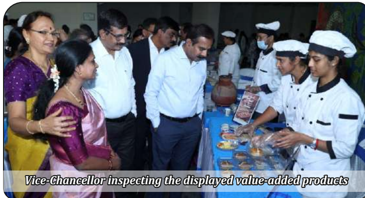
Vice-Chancellor inspecting the displayed value-added products

INSTITUTE OF BAKING TECHNOLOGY AND VALUE ADDITION organised a 'Novel Bakery Products Exhibition-cum-Sale' on 12 th March, 2026 at Dr. Babu Rajendra Prasad International Convention Centre, GVKK as part of the 78 th batch of Bakery Technology Certificate Course. The event