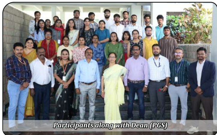
Participants along with Dean (PGS)

DEPARTMENT OF AGRICULTURAL STATISTICS, APPLIED MATHEMATICS & COMPUTER SCIENCE, College of Agriculture, GVKK, Bengaluru, conducted an elite 'LaTeX-Based Scientific Writing: A Hands-on Workshop for Agricultural Research Publication' on 11 th March, 2026 crafted exclusively for