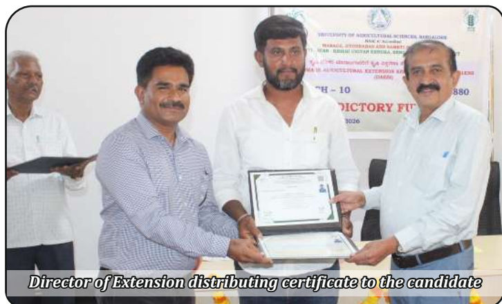
Director of Extension distributing certificate to the candidate

ICAR-KRISHI VIGYAN KENDRA, Bengaluru Rural, hosted the valedictory for the 10 th batch of the Diploma in Agricultural Extension Services for Input Dealers (DAESI) on 26 th March, 2026 at KVK premises. This milestone marked the triumphant completion of a rigorous one-year programme, transforming 32 out of 40 enrolled input dealers into skilled