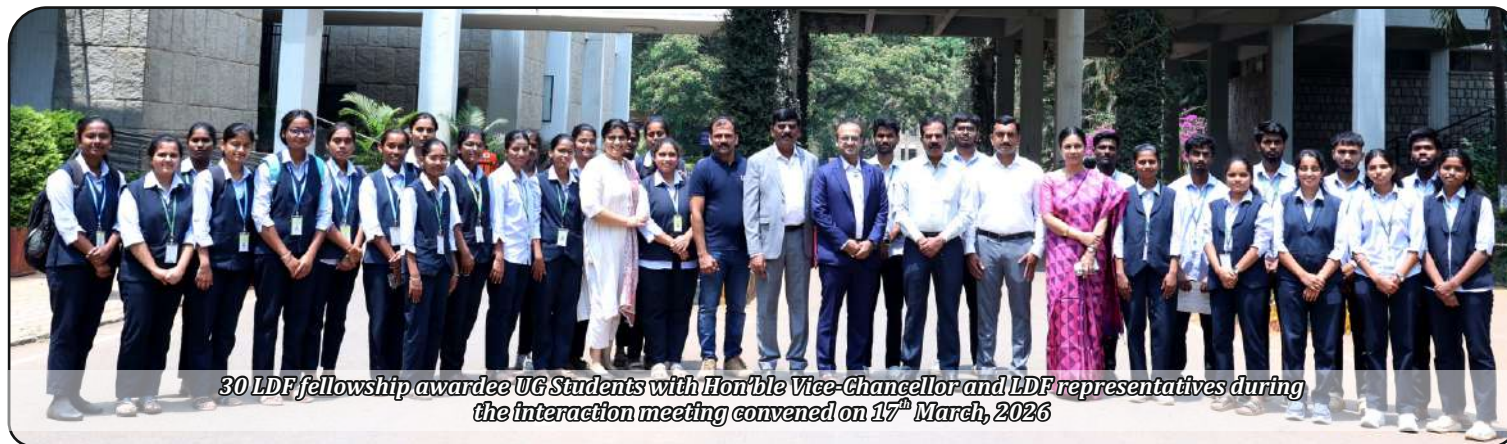
30 LDF fellowship awardee UG Students with Hon'ble Vice-Chancellor and LDF representatives during the interaction meeting convened on 17 th March, 2026