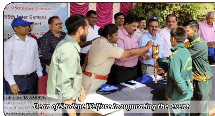
Dean of Student Welfare inaugurating the event

THE 55 th INTER-CAMPUS ATHLETIC MEET was held at College of Sericulture, Chintamani on 12 th & 13 th March, 2026. College of Agriculture, GVKK, Bengaluru teams were the overall