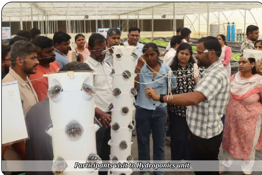
Participants visit to Hydroponics unit

THE AGRI INNOVATION CENTRE OF UAS, BANGALORE successfully hosted its 10-day Navārambha Pre-Incubation Training Programme from 3 rd to 13 th March, 2026 empowering aspiring entrepreneurs and early-stage Agri Start-ups to transform ideas into scalable ventures. Participants engaged in expert-led sessions and hands-on modules on opportunity identification, market analysis, business planning, funding strategies and legal essentials. Interactions with Start-up founders and investors enriched the experience. With 50 attendees and 15 speakers from the Start-up ecosystem, the programme culminated in an on-campus finale. Hands-on exposure to hydroponics and smart agriculture labs, alongside networking, funding insights and experience-sharing sessions, rounded out the event. The initiative boosted participant's entrepreneurial skills, investment readiness and ecosystem connections driving innovation, collaboration, and tech-enabled growth in Agri Start-ups.