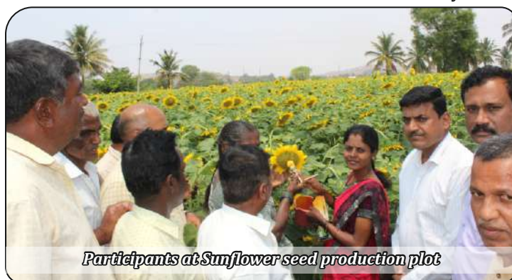
Participants at Sunflower seed production plot