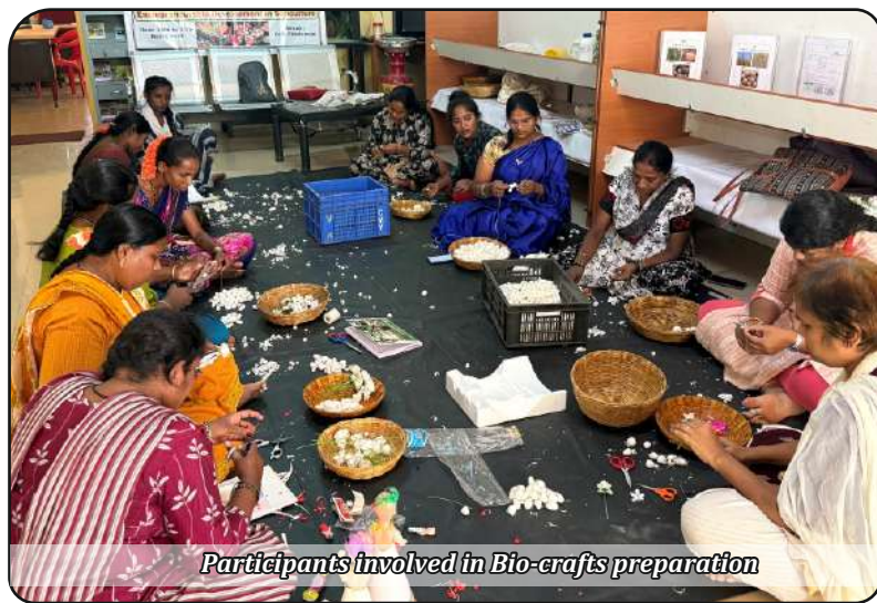
Participants involved in Bio-crafts preparation