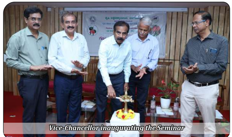
Vice-Chancellor inaugurating the Seminar