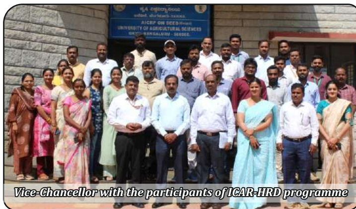
Vice-Chancellor with the participants of ICAR-HRD programme

Management Systems: From Variety to Market' at GKVK, Bengaluru from 10 th to 14 th March, 2026.