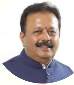
Shri N. Chaluvaryaswamy

Honourable Minister of Agriculture Government of Karnataka & Pro-Chancellor, UASB