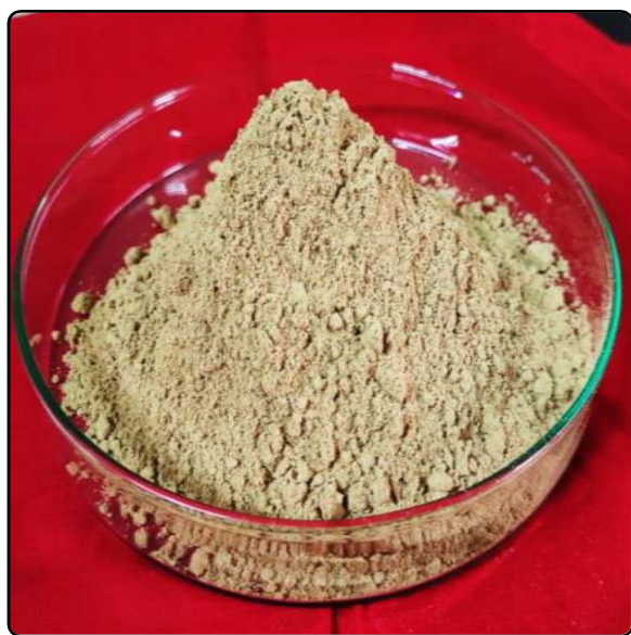
Sweet flag rhizome powder

In adoption of integrating traditional botanical knowledge with modern scientific methodologies this research aims to develop a dependable, affordable and eco-safe seed enhancement technology for field bean growing farmers. The approach will be particularly beneficial to small and marginal land holders in rainfed and resource-constrained regions of South India, where access to synthetic chemicals is limited. The outcome of this research is expected to contribute meaningfully towards improving field bean productivity, seed quality and post-harvest storage management in a sustainable manner. In Karnataka, where field bean is grown extensively as both an intercrop, sole crop under rainfed and irrigated conditions, there is a critical need for sustainable cost-effective seed storage solution. The increasing interest in botanical-based seed treatments offers a new avenue for utilizing Acorus calamus rhizome for enhancing growth parameters.