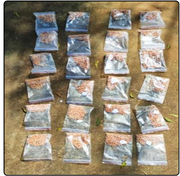
Treated seeds are ready for sowing