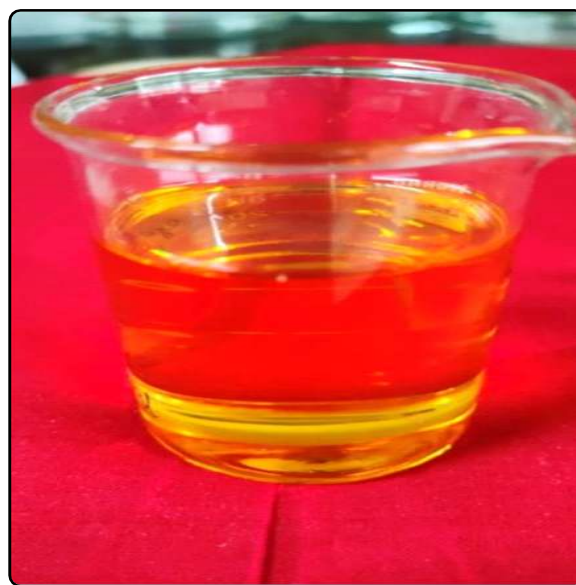
Sweet flag rhizome oil